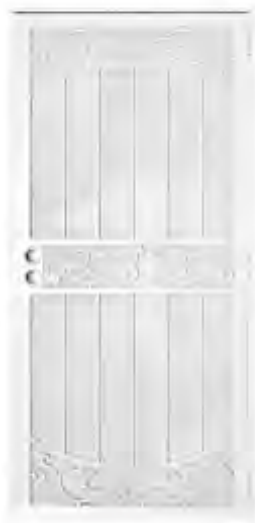
La Entrada White Surface Mount Outswin Steel Security Door with Perforated Metal Screen