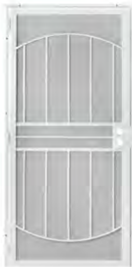
Arcada White Surface Mount Outswing Steel Security Door with Expanded Metal Screen