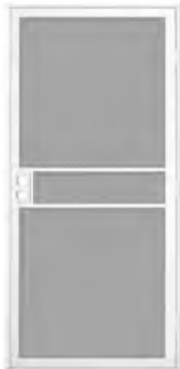
White Surface Mount ClearGuard Security Door with Meshtec Screen